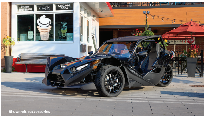
Shown with accessories