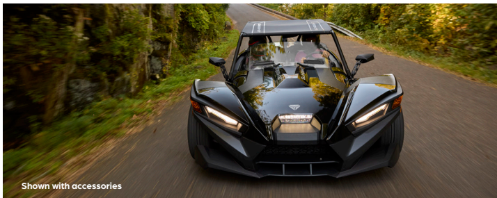
Shown with accessories